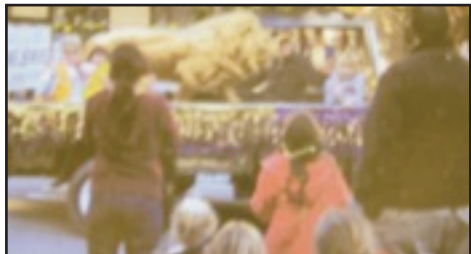
Members of the Berkeley Springs Lions Club parade "LEO the Lion" in the Morgan County Apple Butter Parade.