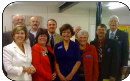
Members of the Inwood Bunker Hill Lions Club gather to celebrate DG Night on October 5.