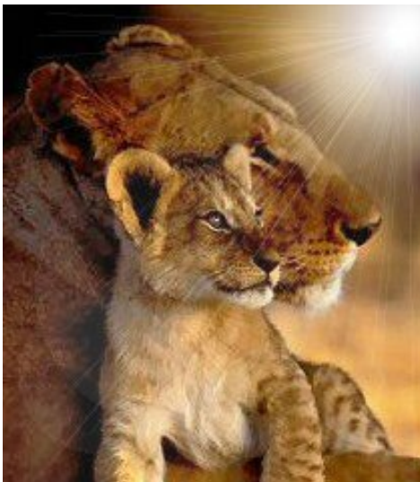
Photo Courtesy of Michel Denis-Hout Available for sale on bigcats.com

Mother, You've given me two things One is roots The other's wings